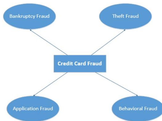
Figure 1: Credit Card Fraud Types

Due to the increasing use of the internet, many companies are offering their services or products in online mode. Credit is now the popular way of making the payments (Srivastava, Kundu, Sural, Majumdar, & computing, 2008). This can be in the form of online payment or any regular payment. The number of transactions that are made through the credit cards are increasing continuously (Chan, Fan, Prodromidis, Stolfo, & Applications, 1999). The credit card frauds are also increasing in the number because of the increasing use of credit cards for transactions (Shen, Tong, & Deng, 2007). This is now easy for the fraudsters to make various types of frauds related to the credit card (Quah & Sriganesh, 2008).