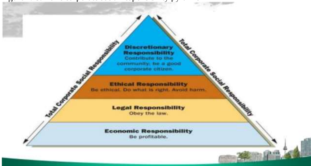
Figure 2: Carroll's corporate social responsibility pyramid