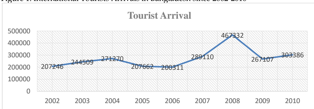
Figure 1: International Tourists Arrivals in Bangladesh since 2002-2010

Source: Bangladesh Tourism Board, National Tourism Organization