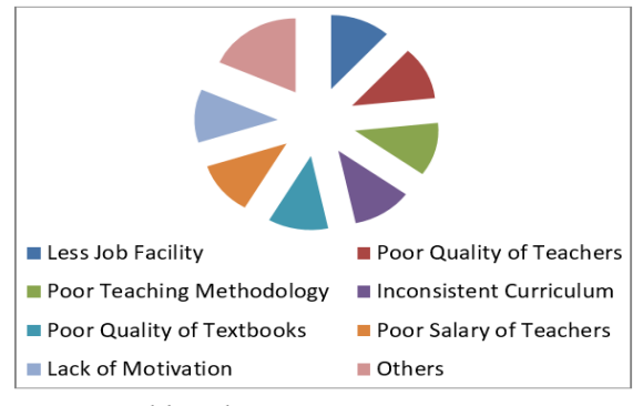
Figure 2: Causes of Decline of Science Education

The study revealed that 7 persons each (11.666%) blamed less job facility, poor quality of teachers, poor teaching methodology, inconsistent curriculum, poor quality of textbooks, poor salary of teachers and lack of motivation respectively, and 11 persons (18.333%) cited other reasons (Figure 2).