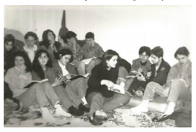
Figure 2: Kosovo Albanian students at the Xhevdet Doda high school at a home-school class in Pristina

After the Kosovo conflict, oppression on Albanian education was lifted, and the Albanians did not have to hide in a parallel, underground system.