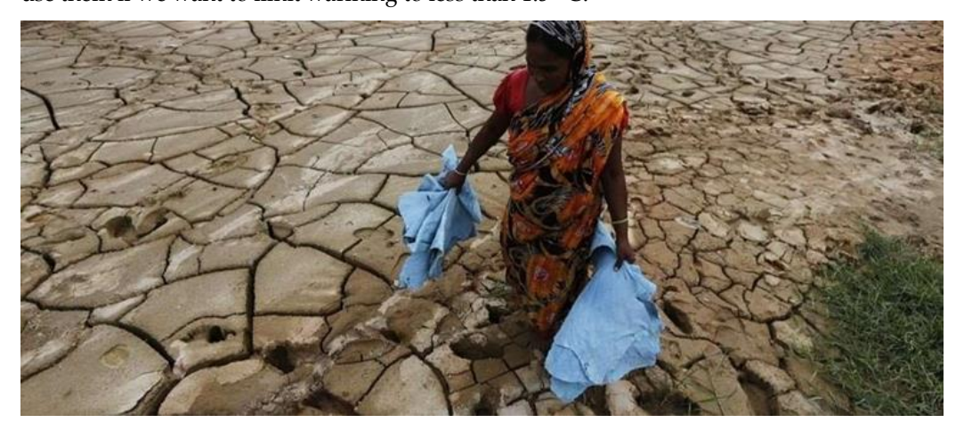
Figure 5: Drought Area

The first step, we should reduce the use of fossil fuels. The rapid transformation of the existing energy systems and infrastructure is a slow process too. However, we are not using the natural climate solutions that already available to us. For instance, we should be willing to use them if we want to limit warming to less than 1.5^{0} C.