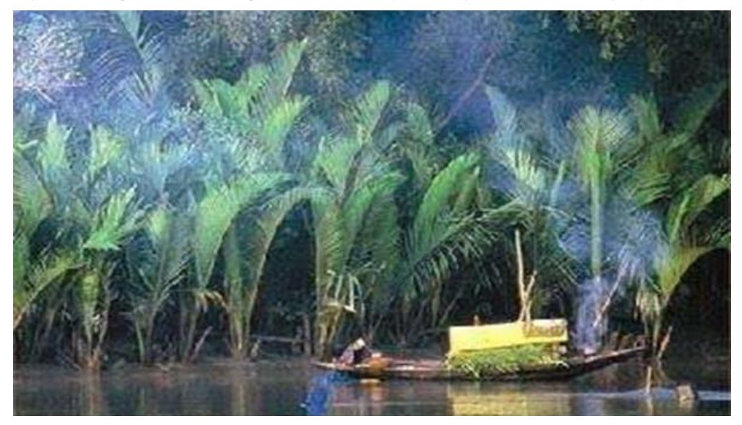
Figure 2: Sundarban

Increasing salinity leads to decreasing of all marine lives. It affects the reproduction of these species. The analysis shows the salinity tolerance range of 70 fish species typically found in the region with expected location- specific water salinity resulting from climate change by 2050.