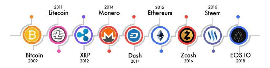
Figure 4: Altcoins

Altcoins is shortened from 'alternative coins.' They are an alternative to bitcoin. They sprung up following Bitcoin's success. Most developers have tried to make coins to follow in the footsteps of Bitcoin. Some solve particular problems associated with Bitcoin use (Donepudi, 2018). Over four thousand altcoins exist. Major altcoins are Ethereum, litecoin, stellar, dogecoin, BNB, Monero, Dash, Cardano, etc.