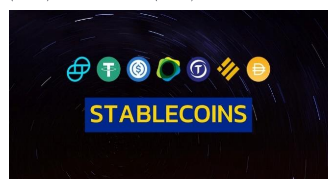
Figure 5: Stablecoin

Stablecoins are created for asset stability. The cryptocurrency market is majorly unstable and highly volatile. Stablecoins were created as a means of storing value in the cryptocurrency world. As the prices of major cryptocurrencies fluctuate now and then, it becomes almost impossible to manage. The value of Stablecoins are tethered to one currency or multiple currencies and placed in reserve to maintain value. Examples of Stablecoins are Tether (USDT) and Binance USD (BUSD).