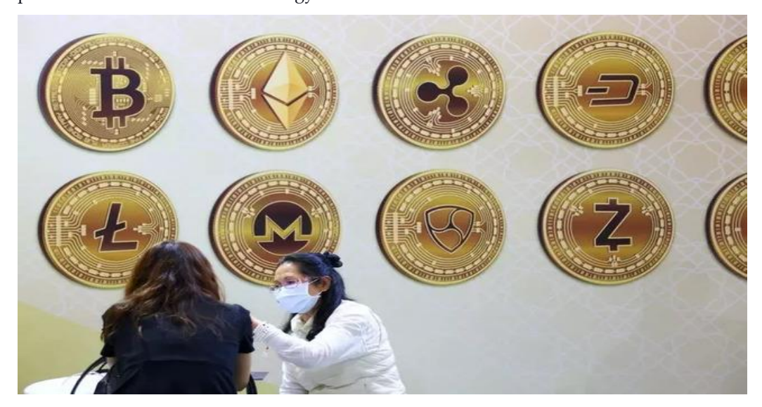
Figure 1: Cryptocurrencies