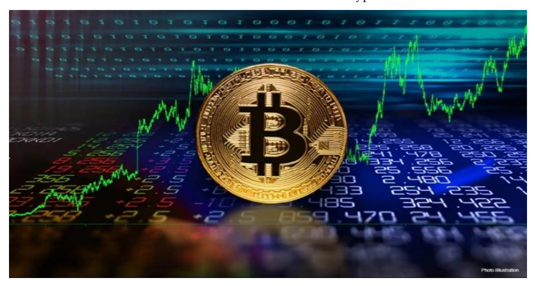
Figure 3: Bitcoin

Satoshi Nakamoto created it. However, seen as many as the father of cryptocurrencies. Bitcoin is not the first cryptocurrency to exist. It was created in 2008 and became popular in 2009. It is seen as the most successful cryptocurrency. Based on blockchain technology which allowed for a secured decentralized network that uses end-to-end encryption from transactions.