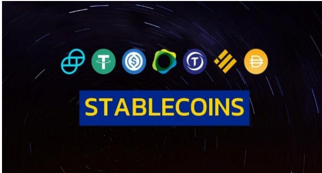
Figure 5: Stablecoin

Stablecoins are created for asset stability. The cryptocurrency market is majorly unstable and highly volatile. Stablecoins were created as a means of storing value in the cryptocurrency world. As the prices of major cryptocurrencies fluctuate now and then, it becomes almost impossible to manage. The value of Stablecoins are tethered to one currency or multiple currencies and placed in reserve to maintain value. Examples of Stablecoins are Tether (USDT) and Binance USD (BUSD).