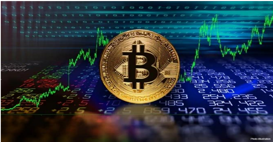
Figure 3: Bitcoin

Satoshi Nakamoto created it. However, seen as many as the father of cryptocurrencies. Bitcoin is not the first cryptocurrency to exist. It was created in 2008 and became popular in 2009. It is seen as the most successful cryptocurrency. Based on blockchain technology which allowed for a secured decentralized network that uses end-to-end encryption from transactions.