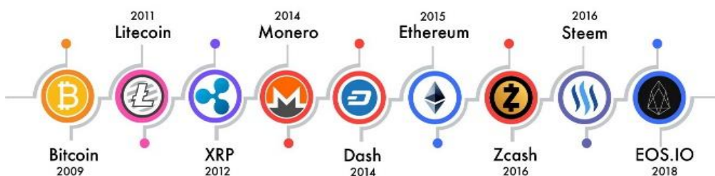
Figure 4: Altcoins

Altcoins is shortened from 'alternative coins.' They are an alternative to bitcoin. They sprung up following Bitcoin's success. Most developers have tried to make coins to follow in the footsteps of Bitcoin. Some solve particular problems associated with Bitcoin use (Donepudi, 2018). Over four thousand altcoins exist. Major altcoins are Ethereum, litecoin, stellar, dogecoin, BNB, Monero, Dash, Cardano, etc.