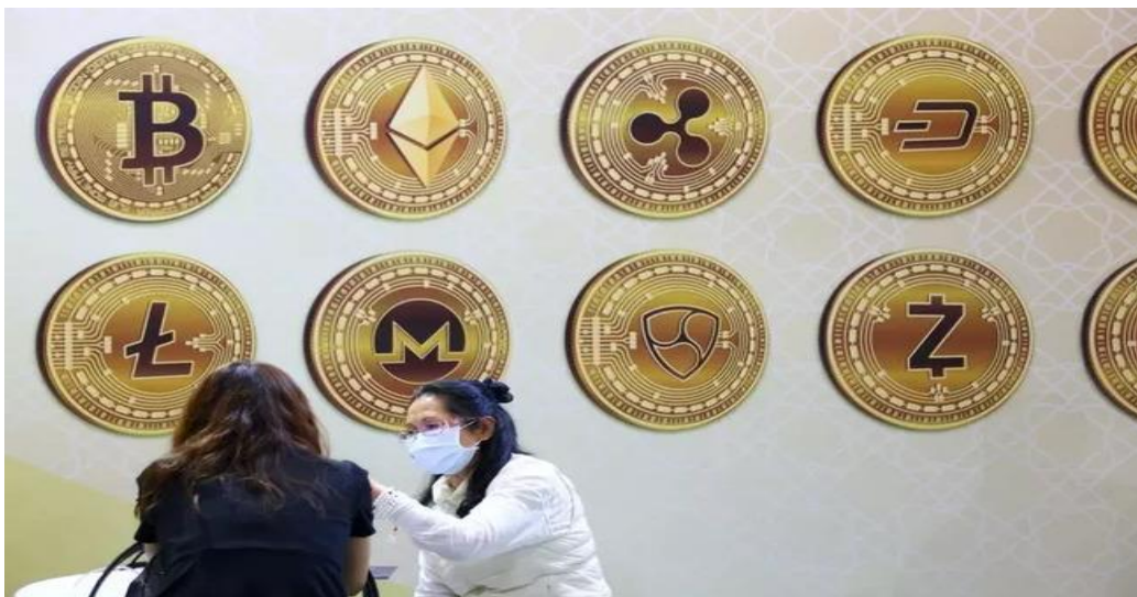
Figure 1: Cryptocurrencies